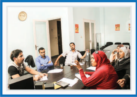
A meeting of Building Capabilities Team.