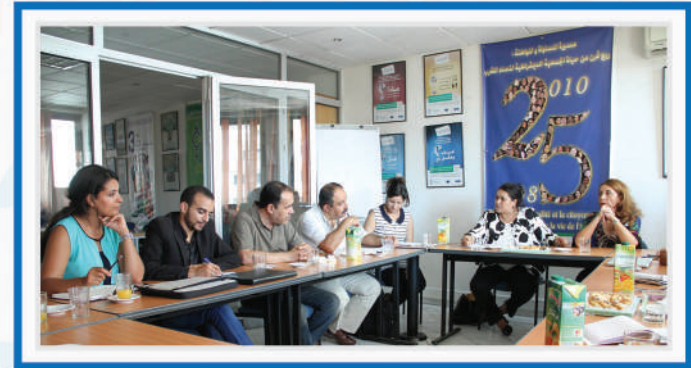
The participants of Civil Society Academy in a meeting with the leaders of Democratic Association of Moroccan Women .