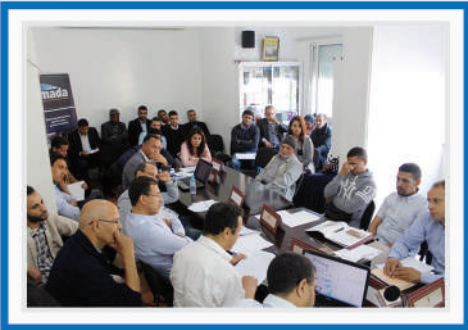
Roundtable about Islamic Movement within Regional Situation and Maghreb Case , 23 rd April 2017.

Civic Forum is the nucleus work team of Center for Humanities Studies and Research – MADA. It has accumulated a long experience at organizing seminars, roundtables, workshops and different activities about various issues.