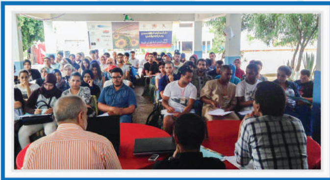
Moroccan political Parties: Rehabilitation and Challenges , 18 th August 2015.