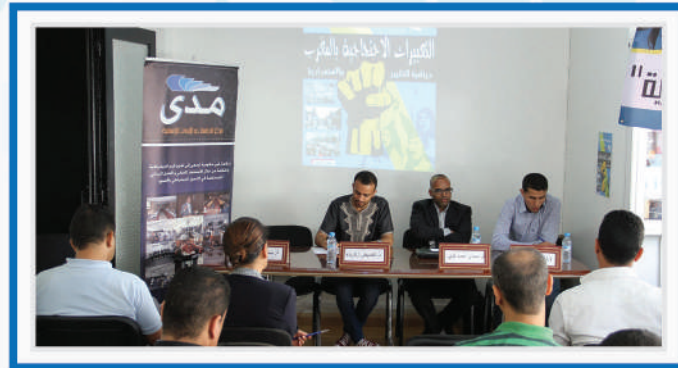
Seminar Day: Protest in Morocco: Changing Dynamics and Continuity , 25 th July 2015.