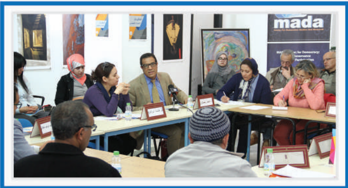
Roundtable: Public Morals , 16 th March 2017.