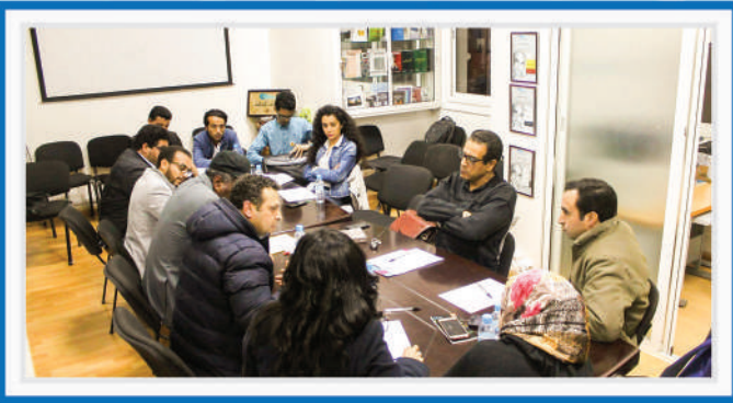
RIHANAT editorial board meeting to determine the upcoming issue topics.