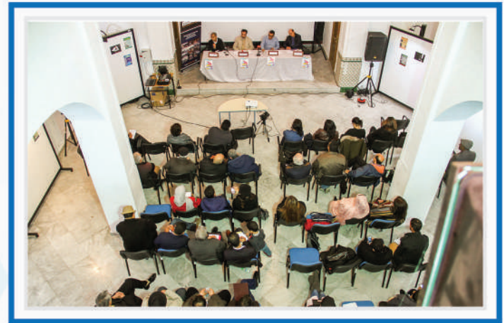
«Media and Moroccan Aspirations» conference, celebrating the 10 th anniversary of RIHANAT. in the Cultural Center of the Old Medina, Casablanca.