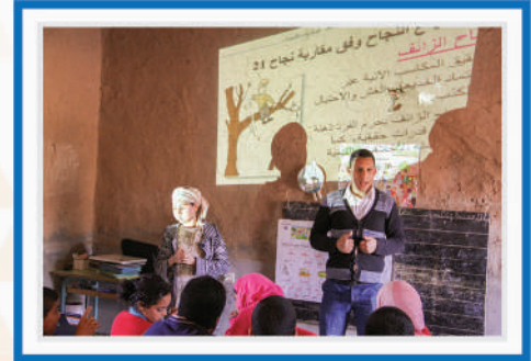
A workshop during the National Campaign to promote "Success in a Changing world Program". The picture was taken in Zagora (the South - East of Morocco).