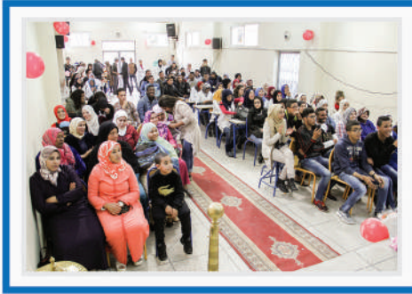
Capabilities Building Team workshop on Mother's Day for students and their parents at Abderrahman Bel Qoreshi High school.