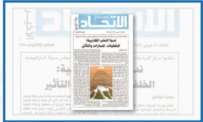
Media Coverage of the second edition of Maghreb Forum: "Maghreb Elites: the background, the paths and the influences"