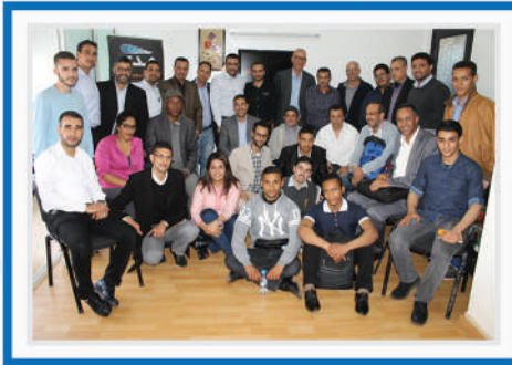
Roundtable about Islamic Movement within Regional Situation and Maghreb Case , 23 rd April 2017.