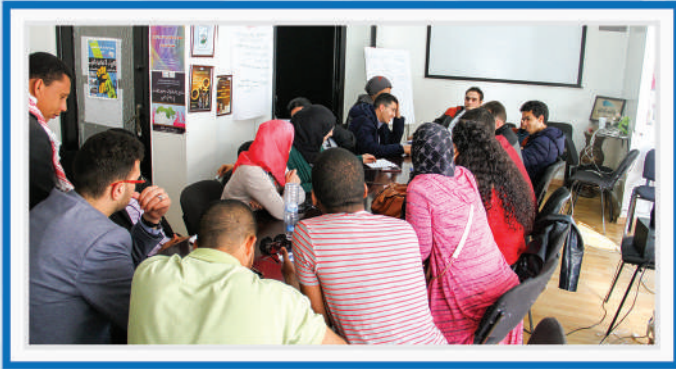
An evaluation meeting in MADA Center of the Participants of the fifth edition of C.S.A