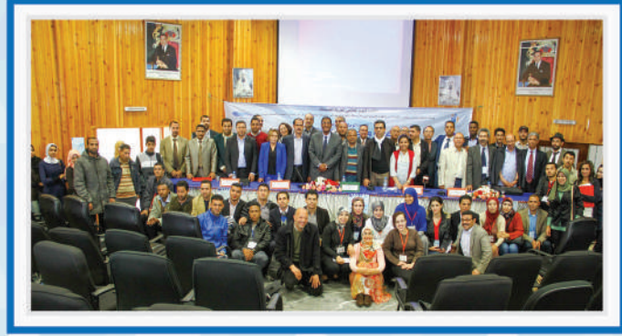
The Third National Conference about Media and the project of Advanced Regionalization , in partnership with Professional Bachelor Degree of Written Journalism in Sultan Moulay Sliman University - Beni Mellal, 5 th May 2016.