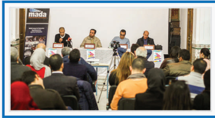
Guest Speakers of the conference, «Media and Moroccan Aspirations»