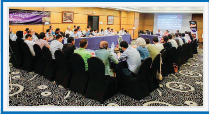
Debate: The Draft Law of Youth and Civic Action Advisory Council , 14 th June 2014.