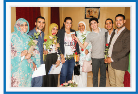
Capacities Building Team coaches and facilitators.