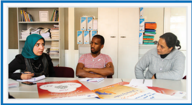
Some participants in a field visit to ENAKHIL Association, partner association in Marrakech.