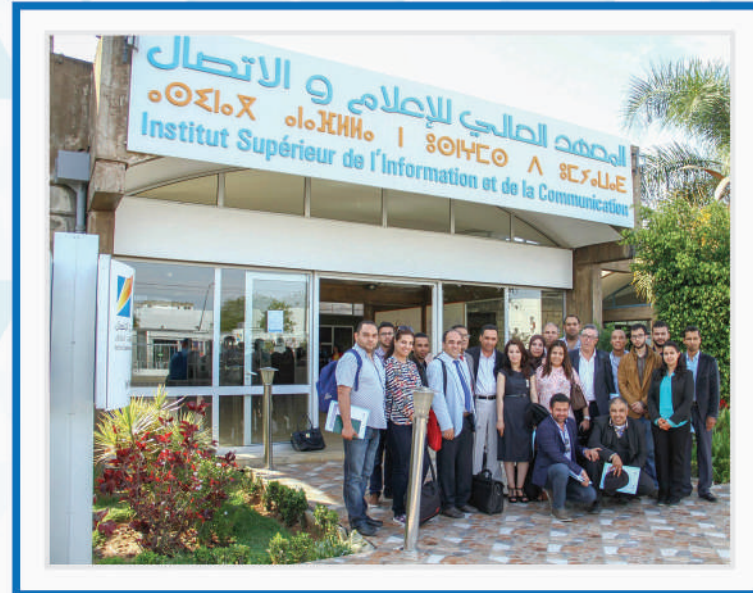
Seminar day about Political Communication and Public Morals organized in partnership with Higher Institute of Information and Communication in Rabat on 27 th May 2016.