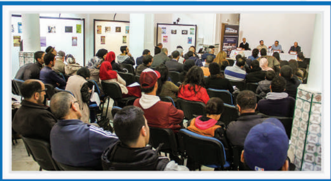
«Media and Moroccan Aspirations» conference, celebrating the 10 th anniversary of RIHANAT. in the Cultural Center of the Old Medina, Casablanca.