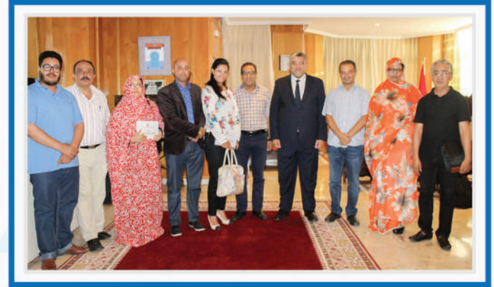
The participants of Civil Society Academy with Mr. Mustapha Ramid, Moroccan Minister of Justice and Liberties.