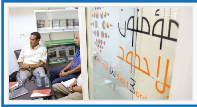
A visit to "Mominoun Without Borders for Studies and Research" in Rabat