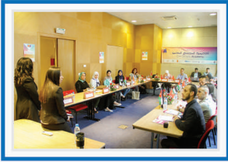
The opening of the 8 th Edition of Civil Society Academy