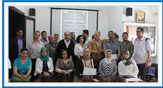
Roundtable: The Moroccan Fine Artist, The Ego and The Other . 23 rd May 2015.