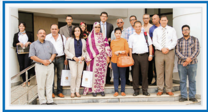
group picture after the same meeting