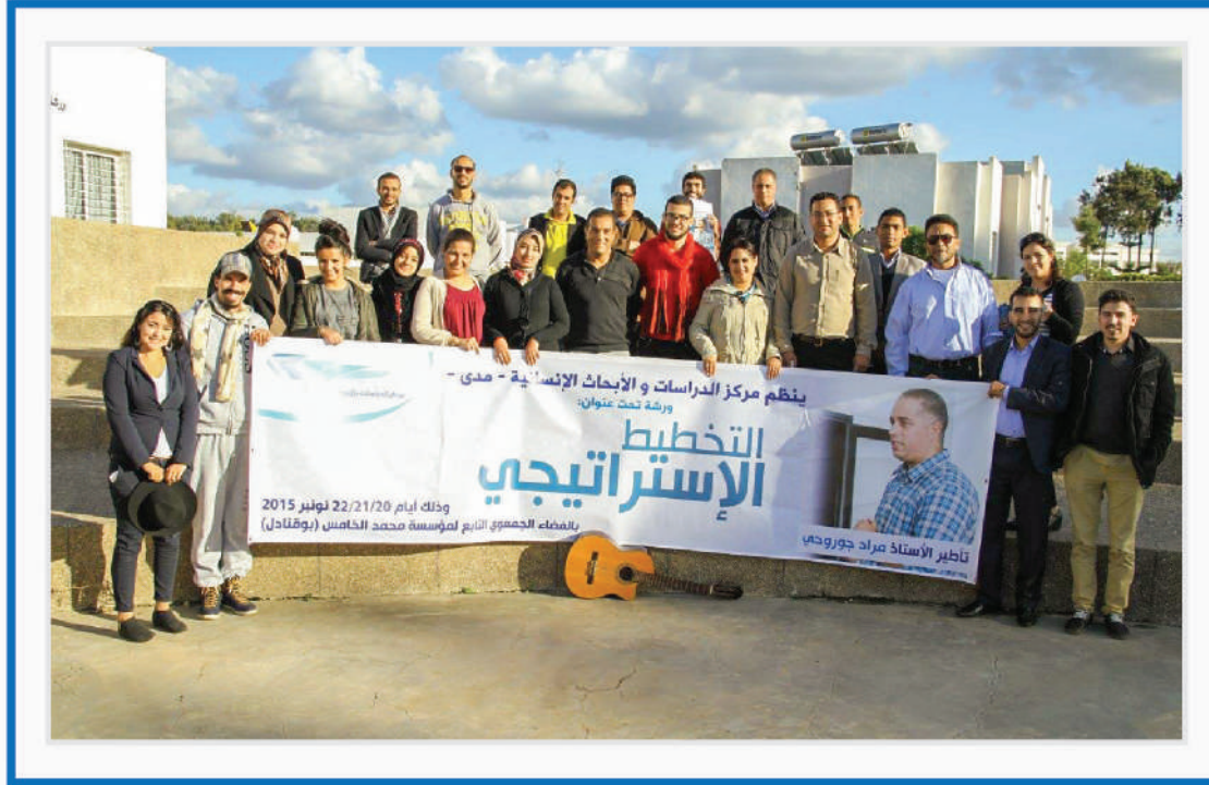
Strategic Planning Workshop of MADA Center, 2015