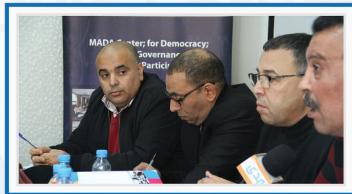
Seminar: Moroccan Political Forces: The Relationship between Political Programs and Alliances , 17 th December 2016.