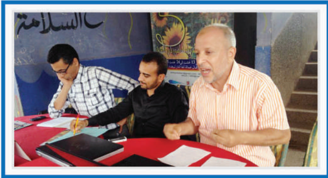
Moroccan political Parties: Rehabilitation and Challenges , 18 th August 2015.