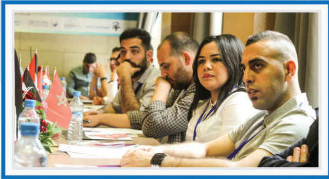
From a theoretical workshop training of C.S.A Program