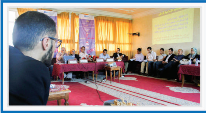
Seminar: Educational Reform in Morocco: what Strategy?