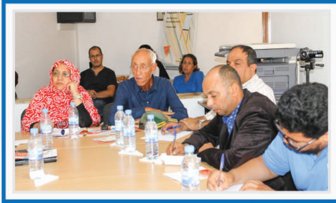
Participants of Civil Society Academy in a meeting with some Moroccan civil society actors in TANMIA Association headquarters.