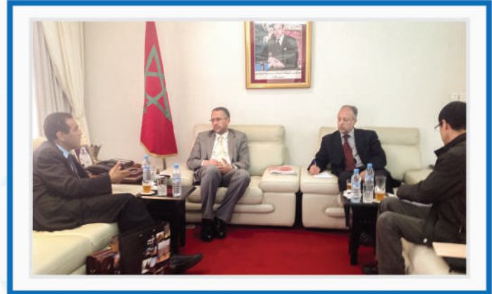
A preparatory meeting with Mr. El Habib Choubani, Minister of Parliamentary Relations and Civic Society for the fifth Maghreb Forum.