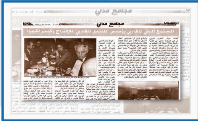
"What is the role of civic society in development and democracy?" Media Coverage of the first edition of Maghreb Forum.