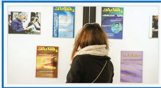
RIHANAT Posters Exhibition.