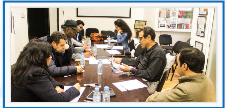
RIHANAT editorial board meeting to determine the upcoming issue topics.