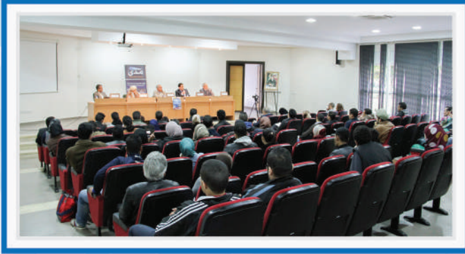
Conference on Judicial Reform organized by MADA Center in the Faculty of Law, Economics and Social Sciences - Ain Chok.