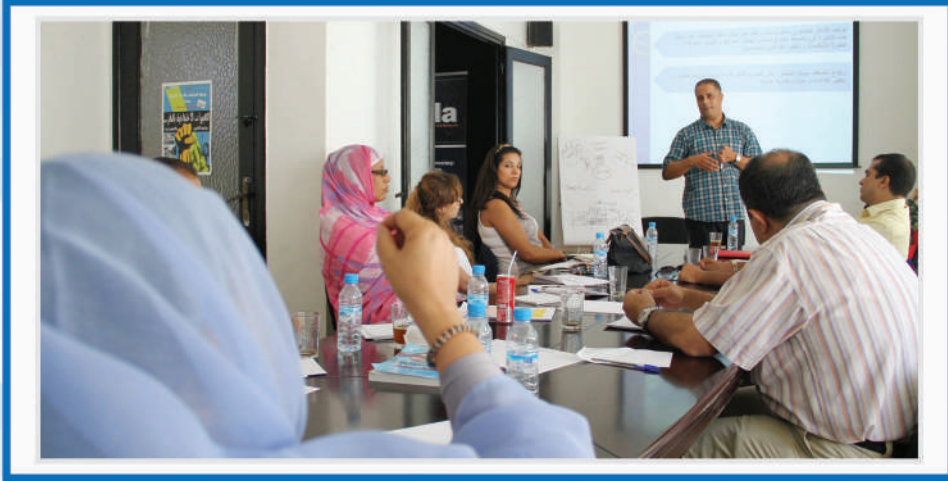
Strategic Planning workshop with the involvement of the participants of C.S.A in MADA Center.