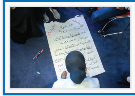
From the theoretical training of C.S.A Program.