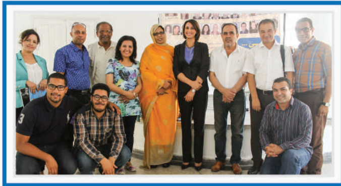
A group Picture after a successful meeting with the General Secretary of United Socialist Party, Dr. Nabila Mounib.