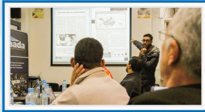
RIHANAT graphic designer presenting the new design in its 10 th anniversary.