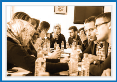
Meeting of the Facilitators of the national campaign to promote "Success in a Changing world Program".