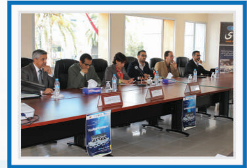
MASSAR System: Prospects and Challenges , in partnership with Regional Academy of Education and Training - Casablanca, 18 th March 2014.