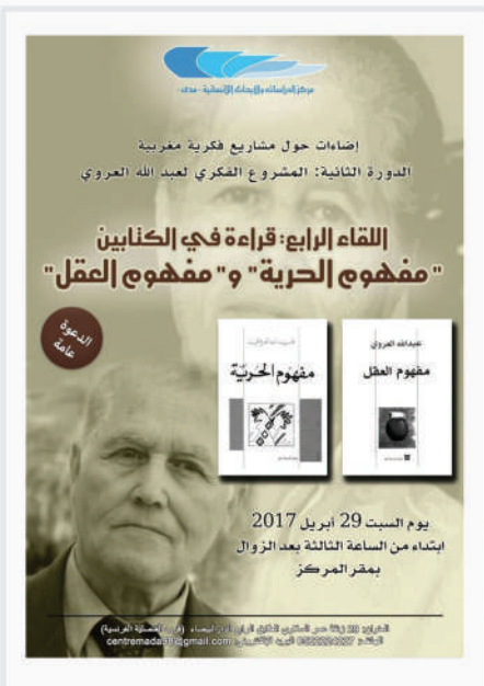
One of the "Moroccan Intellectual Projects in Spot Light" second edition poster

Pictures of the Second edition project: "Moroccan Intellectual Projects in Spot Light" (which was about the Moroccan thinker, Dr. Abdallah Laroui ).