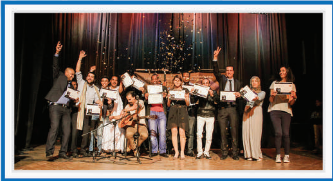
Closing Ceremony of the first edition of C.S.A which is overseen by IRI and NDAW in partnership with MADA Center.