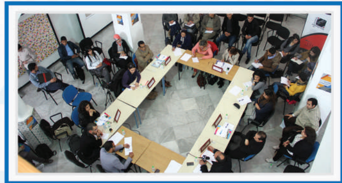
Roundtable: Public Morals , 16 th March 2017.