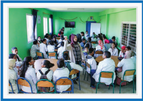
The Participants of the first edition of C.S.A leading a workshop about civil conduct in a secondary school