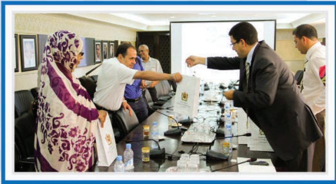
A meeting between the participants of Civil Society Academy and the Ministry of Parliamentary Relations and Civic Society discussing the outcomes of The National Dialogue about Civic Society .